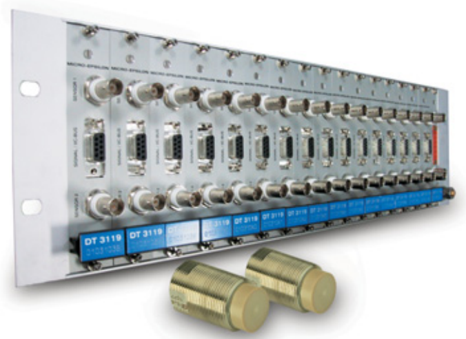
19"-rack for electronics and sensors EU6