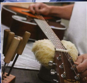
Motion control for guitar manufacturing

Fidel, Partner der Post AG, Bismarckstraße 10 / Betrieben : Postfach 1072 36243 Hildersheim