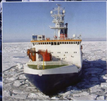
Turbo couplings for ice breakers