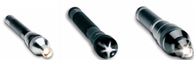
Mini Maglite hand light source