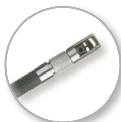
90° prism head (optional)