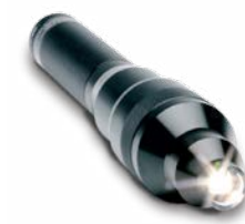
SuperNova LED hand light source