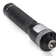
SuperNova LED hand light source