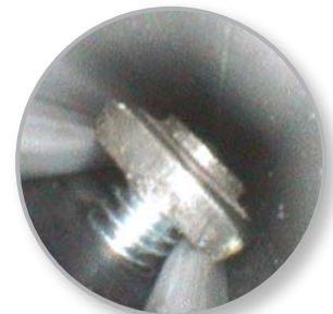
Position of a screw