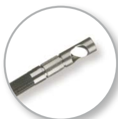
90° mirror head