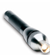
Mini Maglite hand light source