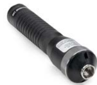
SuperNova LED hand light source