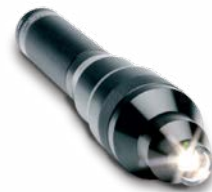
SuperNova LED hand light source