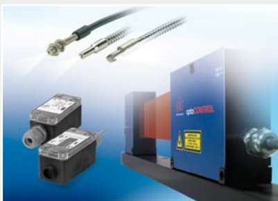
Optical micrometers, fibre optic sensors and fibre optics