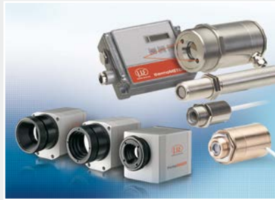
Sensors and measurement devices for non-contact temperature measurement