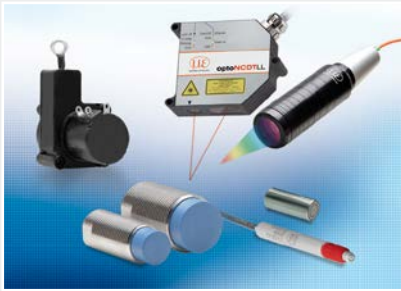
Sensors and systems for displacement and position