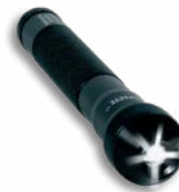
LED hand light source