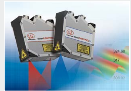
2D/3D profile sensors (laser scanner)