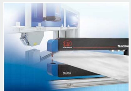
Measurement and inspection systems