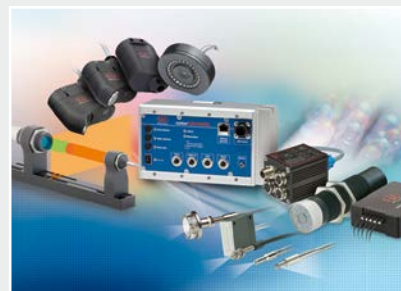
Colour recognition sensors, LED analyzers and colour online spectrometer